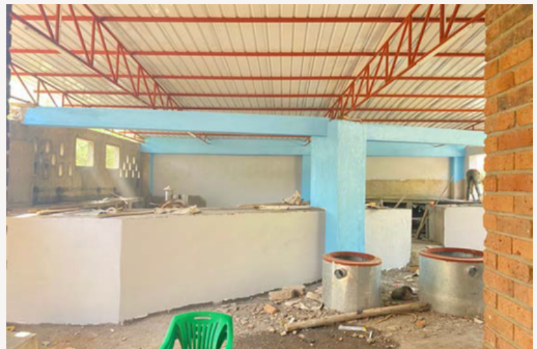
Outdoor kitchen interior.