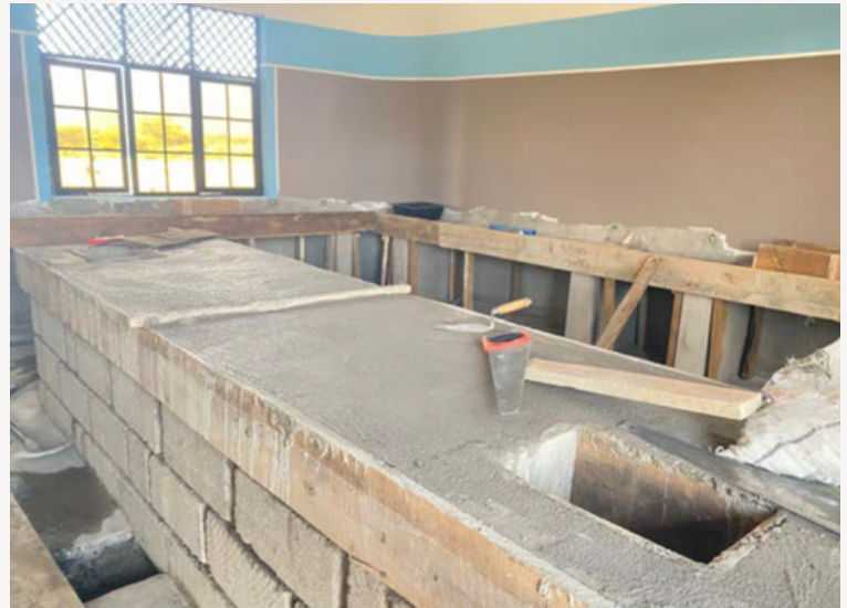
Chemistry & biology lab interior.