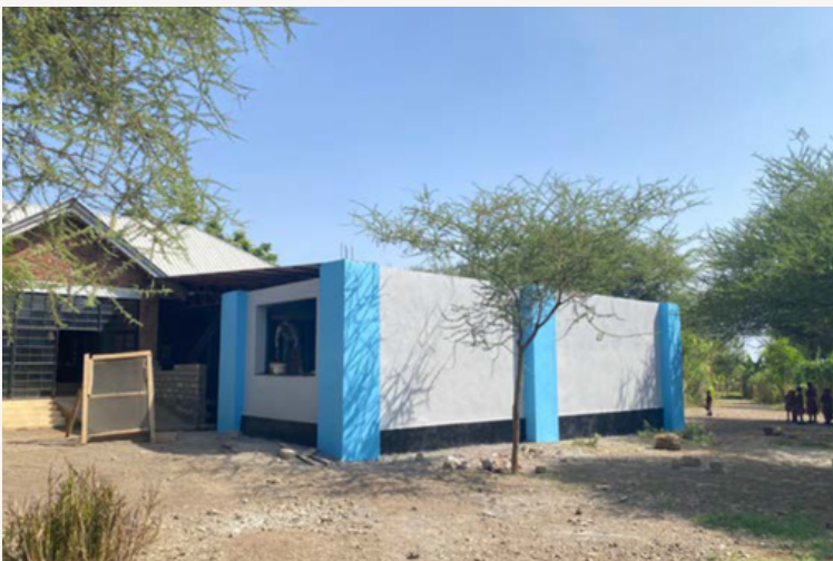
Outdoor kitchen exterior.