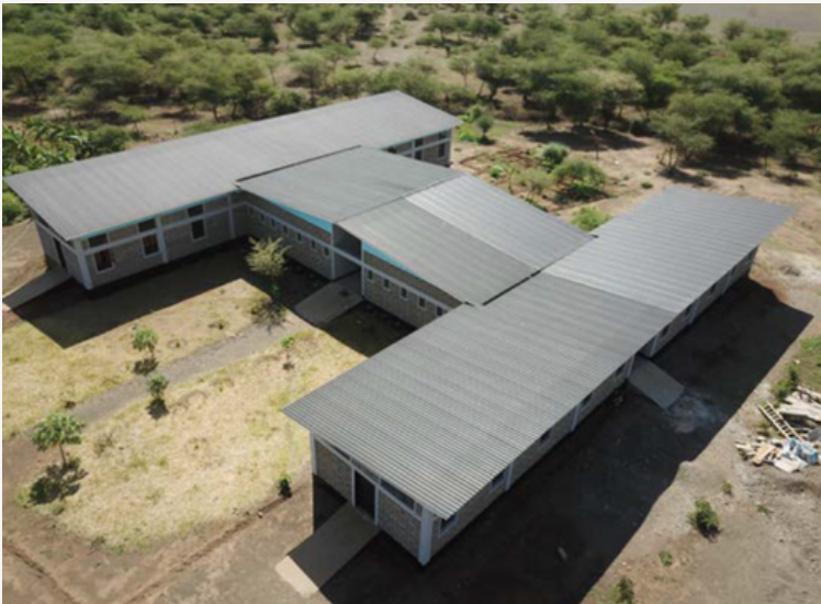
Boys' dormitory exterior.

Construction on campus continues. The fourth wing of the boys' dormitory and associated washroom facilities has been completed. Construction of the fourth wing was supported by a $53,050 USD grant from MEF. Remaining needs include bunkbeds and other furnishings. Additionally, a new outdoor kitchen adjacent to the Peter Ozolin Dining Hall is nearing completion. The kitchen addition is needed to support the growing enrollment and was partially supported with a dedicated donation made through MEF. The ENCO Secondary School (ENCOS) chemistry and biology labs are also nearing completion. A generous donation from Rob Crane and his family of Columbus, Ohio helped to fund labs construction. Additional donations are needed to fully outfit the labs and make them operational.