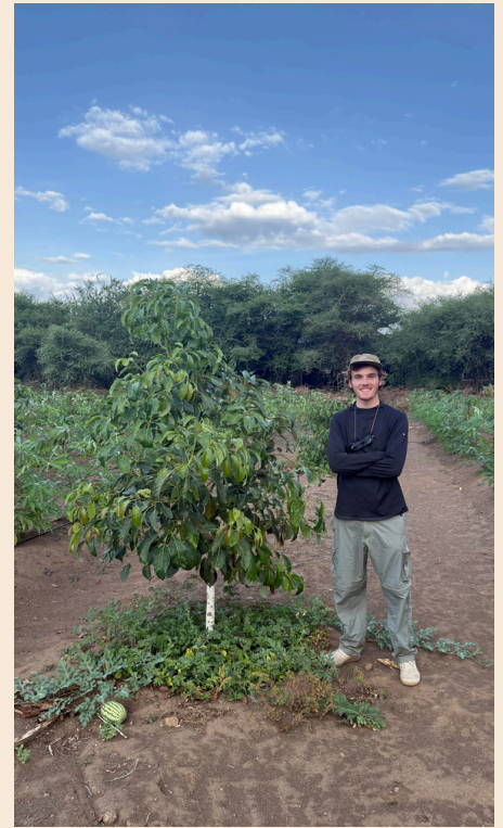
Avocado tree in Nov. 2025.