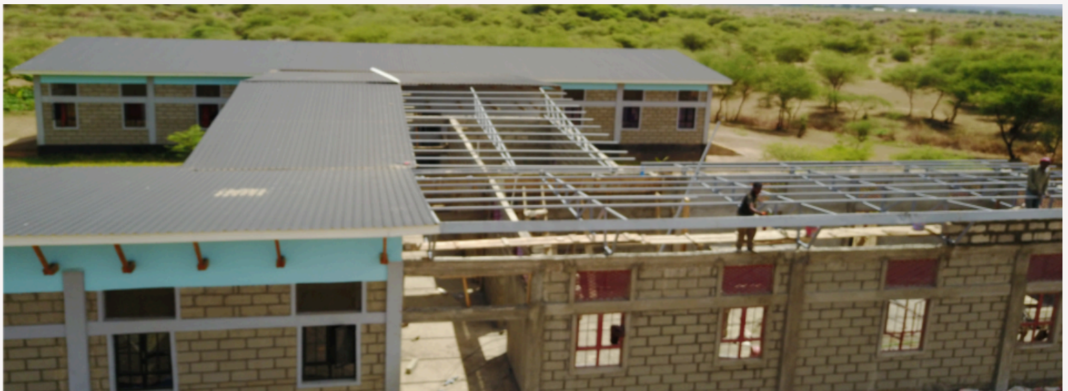
Low angle drone photo of boys' dormitory showing roofing installation.

To improve the school's ability to prepare and serve food for the growing student population, an outdoor kitchen extension is being constructed. The outdoor kitchen is adjacent to the Peter Ozolin Dining Hall. The kitchen will have two wood-fired stoves, electricity, and water. The large opening seen in the pictures below will enable staff to rapidly serve food to students. Construction funds for the new outdoor kitchen were provided by non-MEF donors.