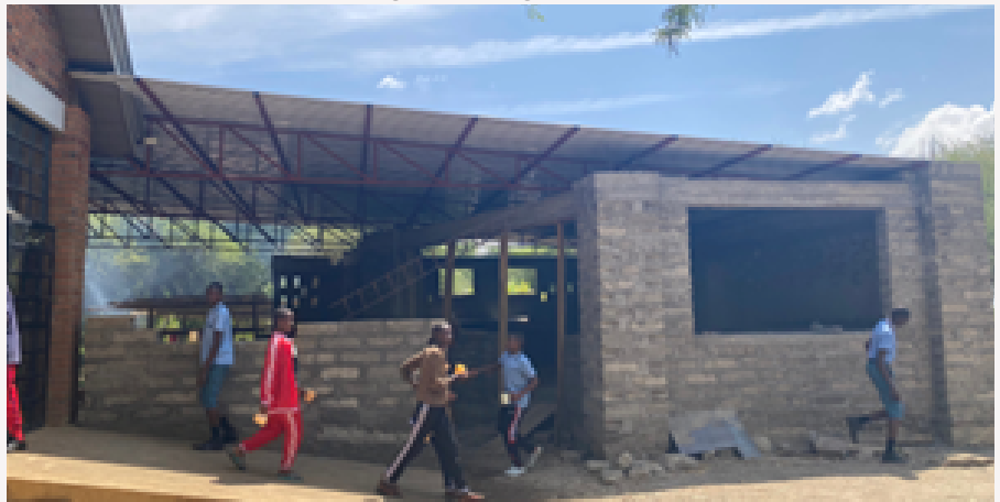
Outdoor kitchen at ground level.