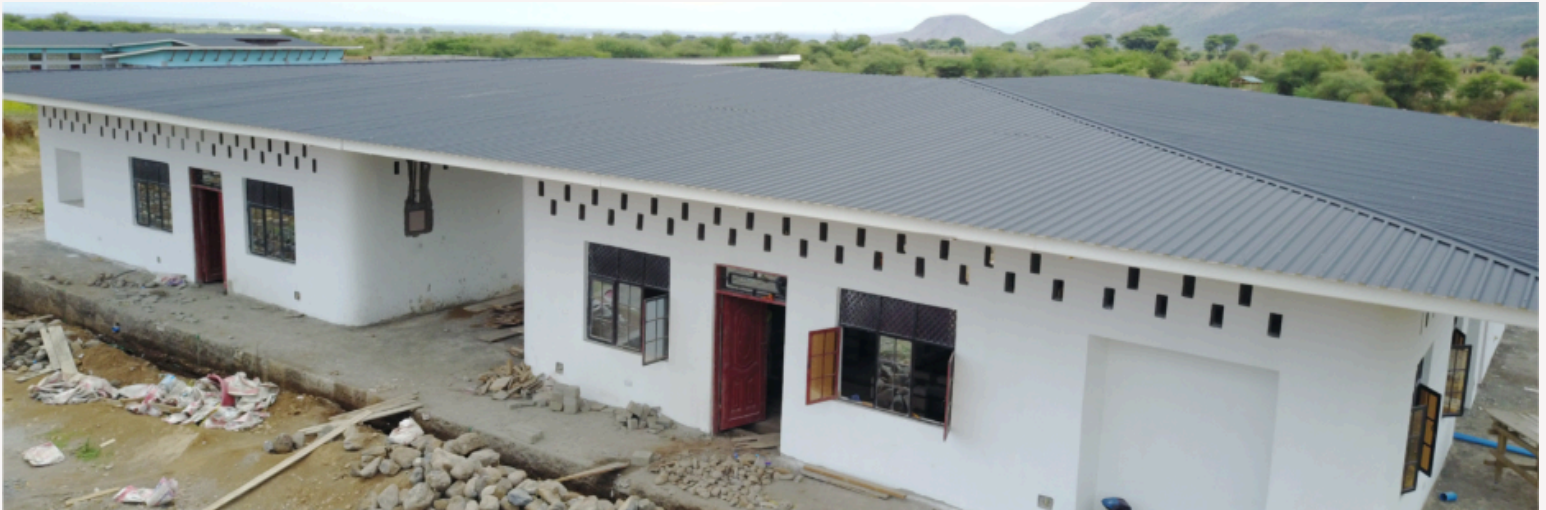
Drone photo of the ENCOS biology and chemistry lab building.

Progress also continues with the two ENCO Secondary School (ENCOS) laboratory buildings (biology and chemistry) and girls' and boys' secondary school washroom facilities. The washrooms have been completed. Remaining work includes completion of the student workstations and interior furnishings. The construction of these buildings was made possible by the Crane family of Columbus, Ohio.