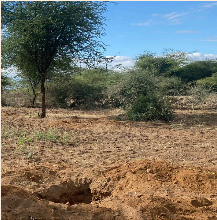
Holes dug in May 2023.