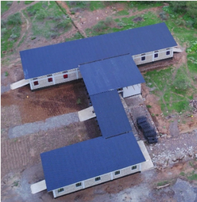
Aerial shot of the dorm with three wings.

Planning is well underway for the second of MEF's two annual fundraisers, our year-end Giving Tuesday Fundraiser (November 27th to December 31st) when MEF has historically focused on increasing the number of students that MEF donors generously sponsor.