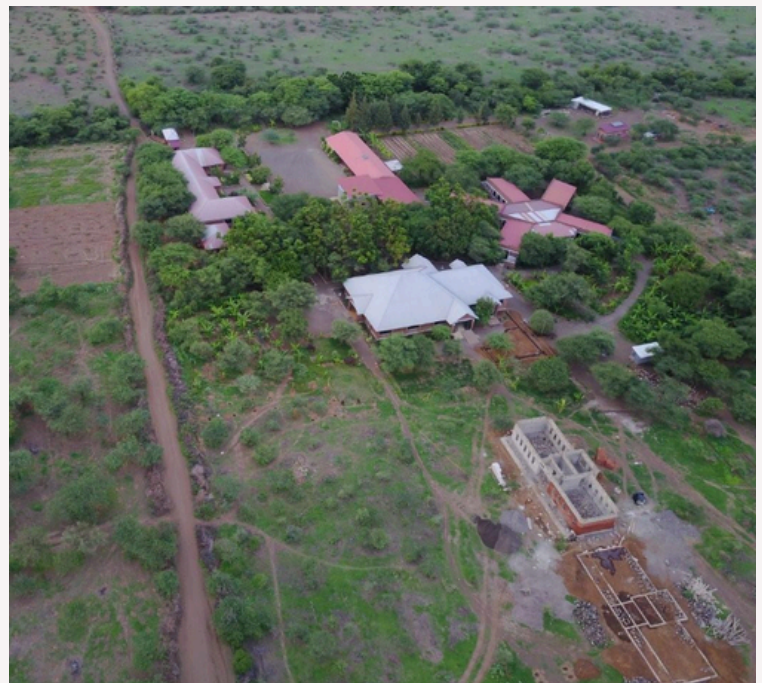
Campus in Dec. 2024