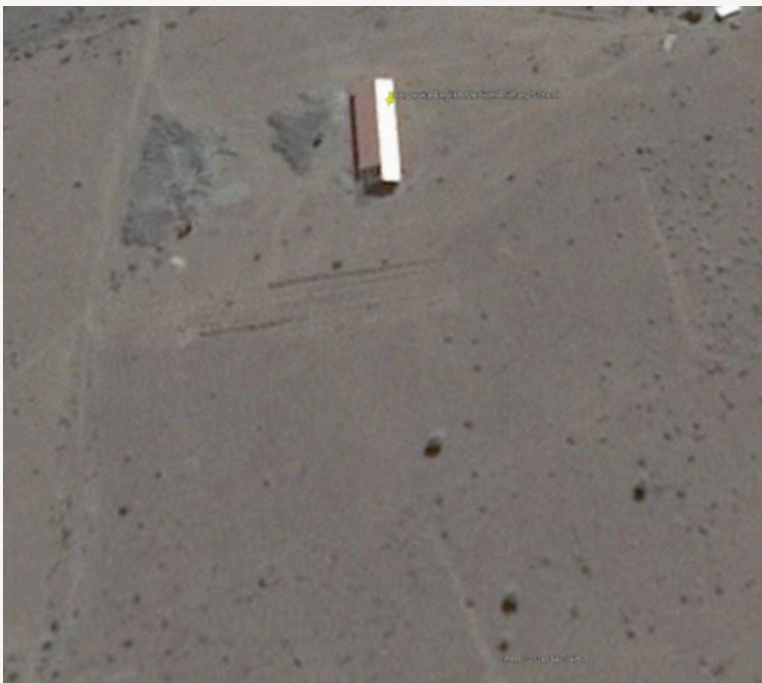
Campus in Sep. 2017