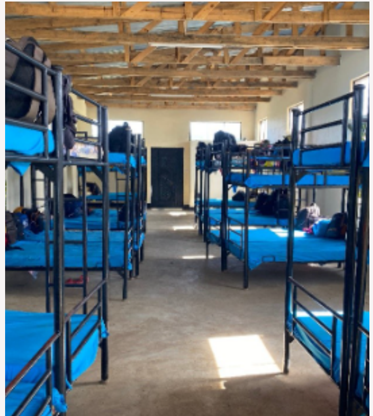
Interior shot of a completed wing.