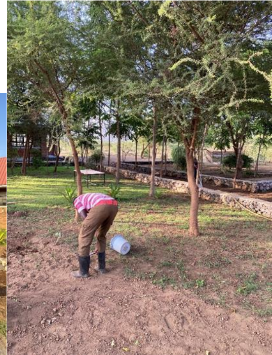
Extension of gardens areas