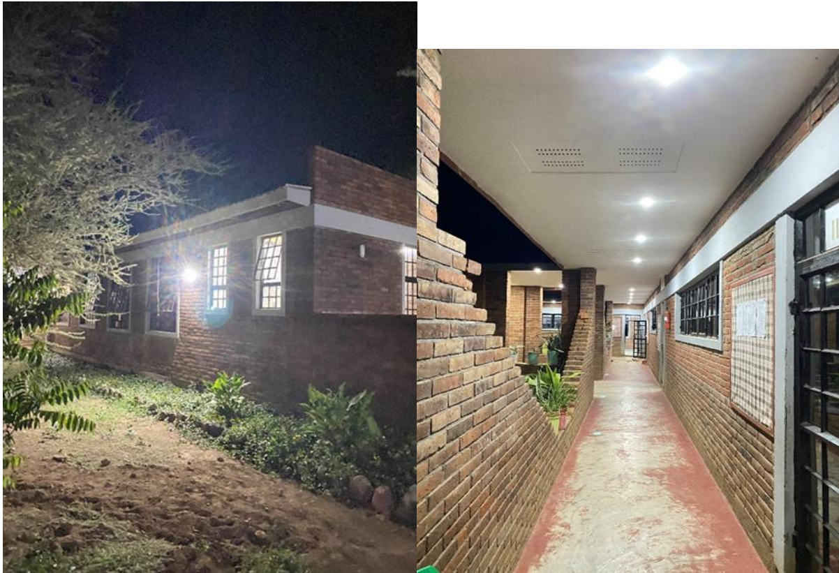
Classrooms at night