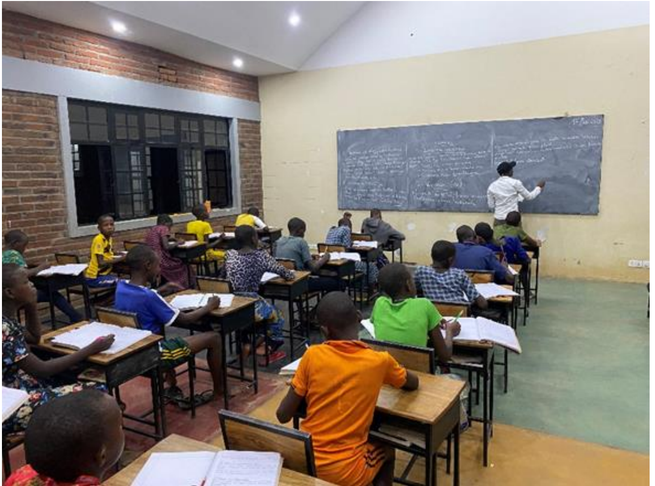
Class six on evening classes