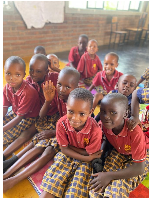
Nursery class 2023