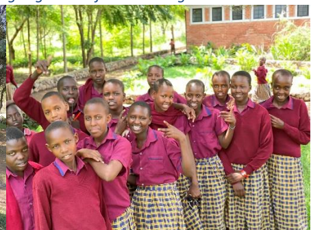
Our 7 th grade ladies