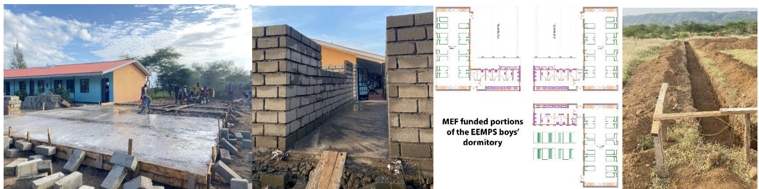
Classroom addition to TX Pre-School Building

The boys' dormitory will consist of three wings with bathroom facilities, each wing housing 40 to 45 boys. The total cost of the boys' dormitory is $188,253 and we need to raise an additional $26,137 to complete construction by July 2024.