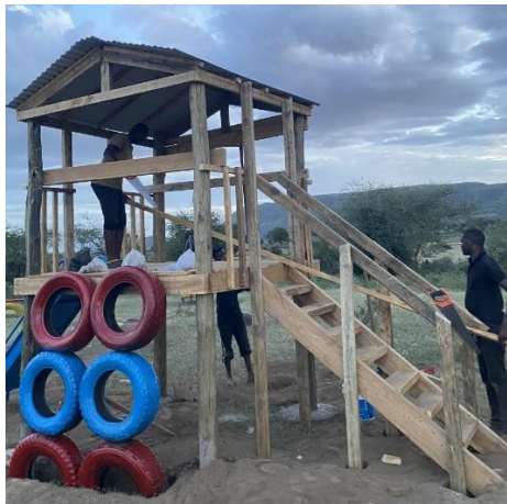
Construction of new playground tower