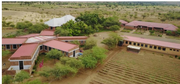
Engaruka English Medium Primary School