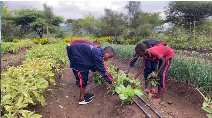
Students harvesting vegetables from school garden