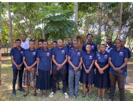
EEMPS teaching staff