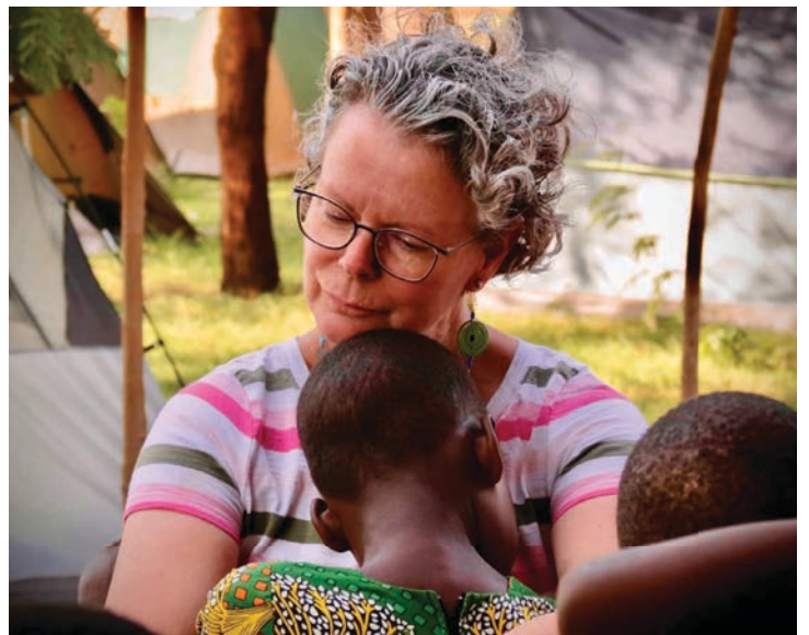
Sponsor meets her student