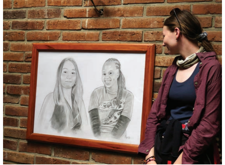
Above (l to r): Crane family members in front of the Crane Classroom & Library Building. The Daphne Kibler & Maria Paapi Kingi girl's dormitory wing dedication

Before arriving at the school, the group went on a 5-day safari and visited Serengeti National Park and Ngorongoro Crater, seeing the big five (lion, leopard, elephant, rhinoceros, and Cape buffalo) as well as countless wildebeest, zebra, giraffe, hippos, and other animals during Africa's great migration. It truly was a life-changing trip, particularly the visit to the school. It was so successful that MEF is now planning to organize similar trips in the future.