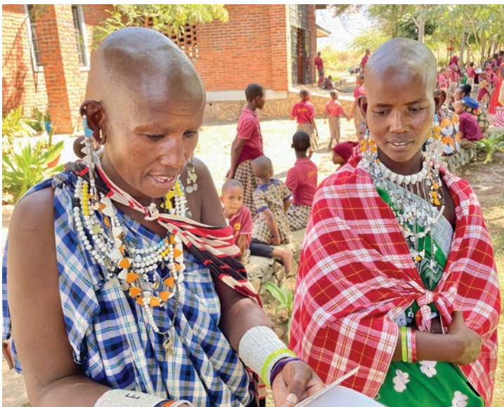
Looking at photos from sponsors

The group spent three days touring the school and interacting with students and staff. All the students were eager to engage in conversation, practicing their English skills. They also convinced a few in the group to play soccer with them. It provided a wonderful opportunity for sponsors to meet and spend time with the impressive students they sponsor. In several cases participants also met the parents of their students. It was a very emotional experience.