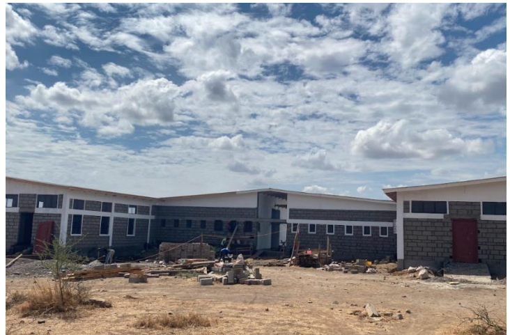
Boys' Dormitory Courtyard