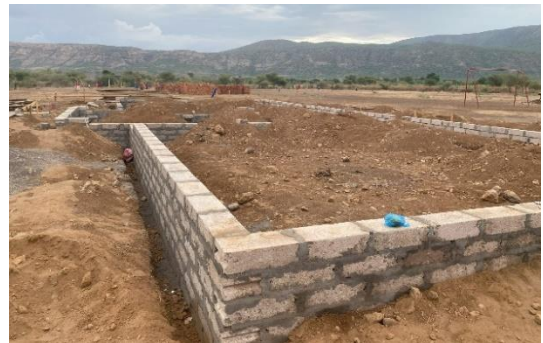
ENCOSS Classroom Building Progress, Oct. 2024

How EEMPS is Protecting Girls: Combating FGM and Early Marriage: EEMPS and the proposed ENCO Secondary School place a high priority on protecting girls from FGM and early childhood marriage. Some girls have trekked to the school, requested asylum, and been admitted to the school to escape forced early marriages and possible FGM. EEMPS also identifies girls at high risk, invites them to attend, and convinces their families of the advantages of having an educated daughter. Why are FGM and early marriage such an issue for our students, even when they are illegal?