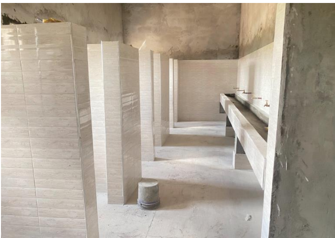
Boys' Dormitory Restrooms